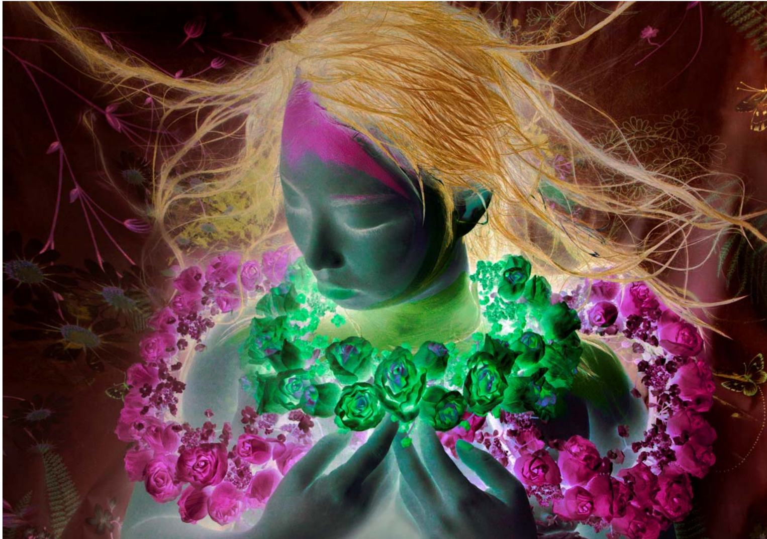
Portrait of a Girl II C-Type Lambda print, Diasec mounted, ed. 5, 2010 76 cm x 107 cm £2950