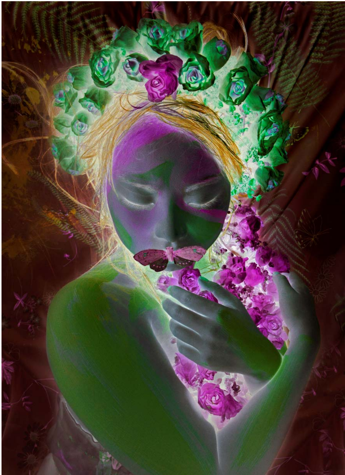
Portrait of a Woman C-Type Lambda print, Diasec mounted, ed. 5, 2010 76 cm x 107 cm £3500 (edition sold out - only Artist Proof available)