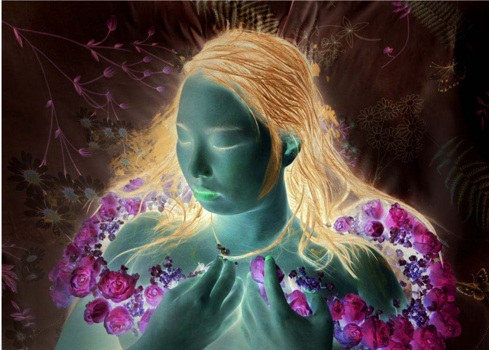
Portrait of a Girl I